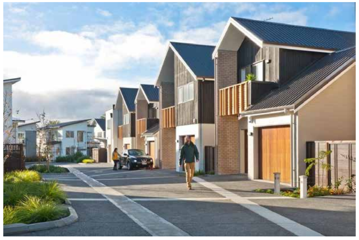
While providing an excellent edge towards Buckley Avenue, the terraces provide an attractive interface with its rear lane when viewed from Lester street.

The terraces comprise of two corner units and four courtyard houses.