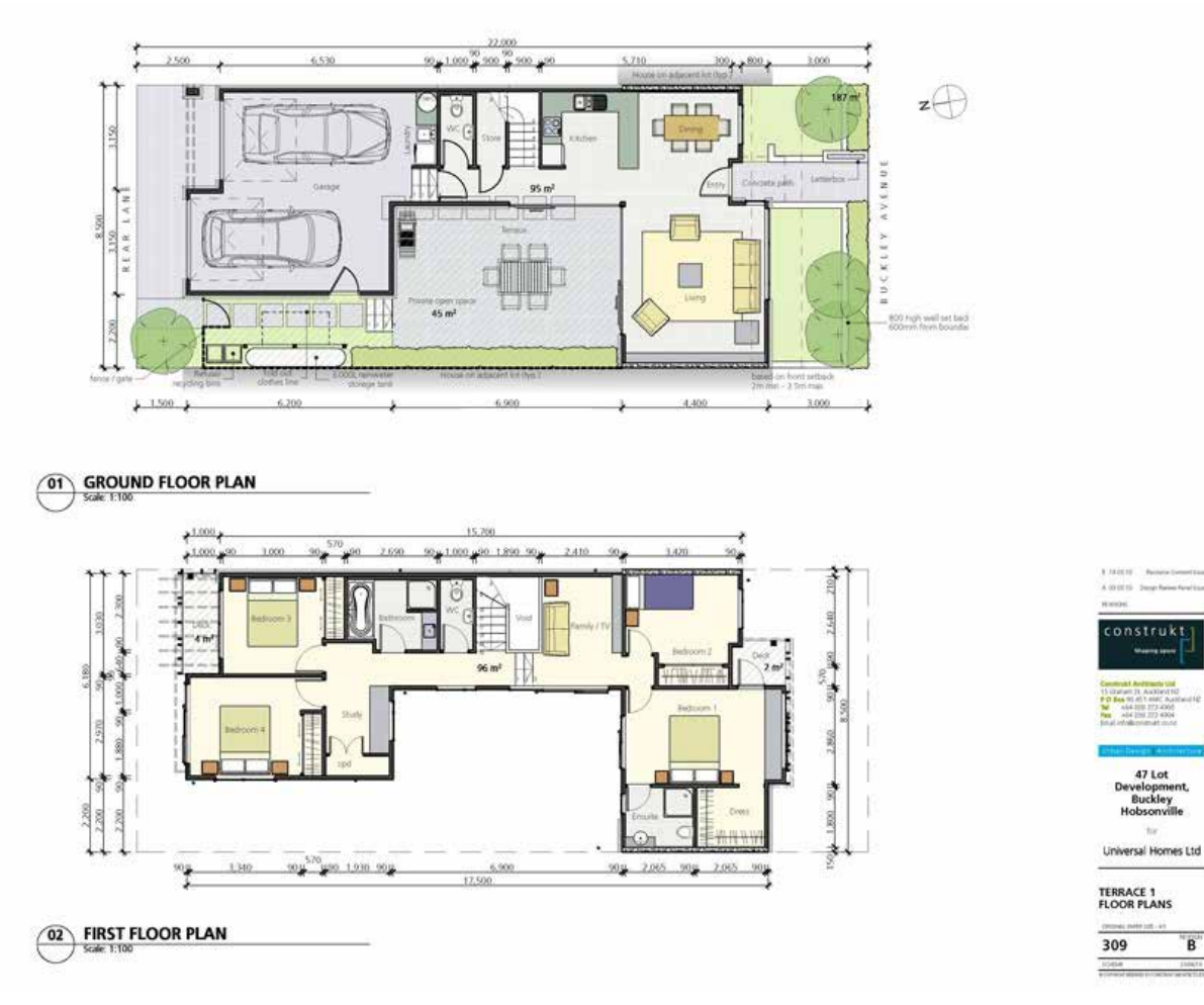
Floor Plans of LOT 7,9,13 & 15 - Four bedroom terrace house (courtyard units).