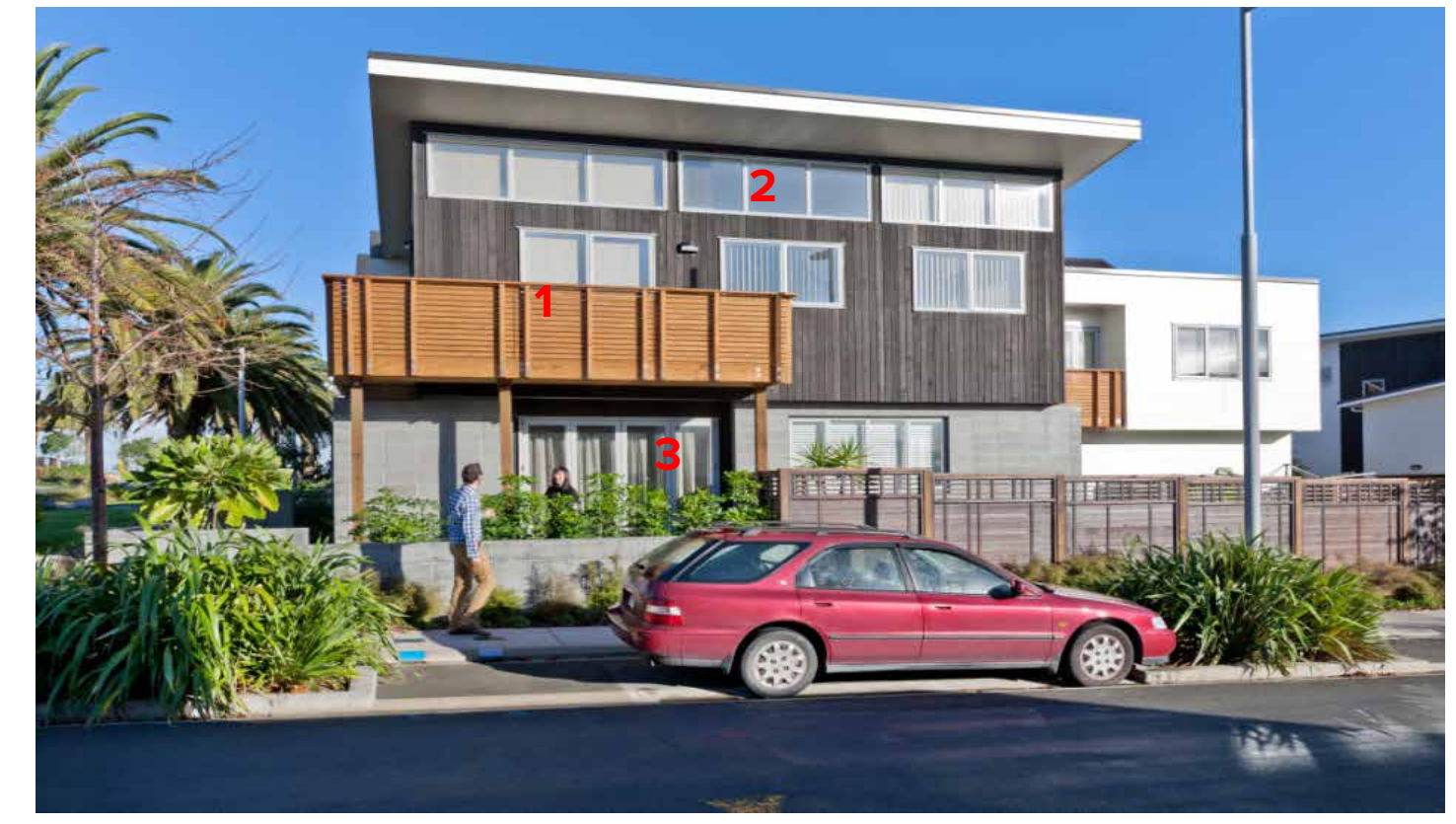
View of the corner terrace from Lester Street.