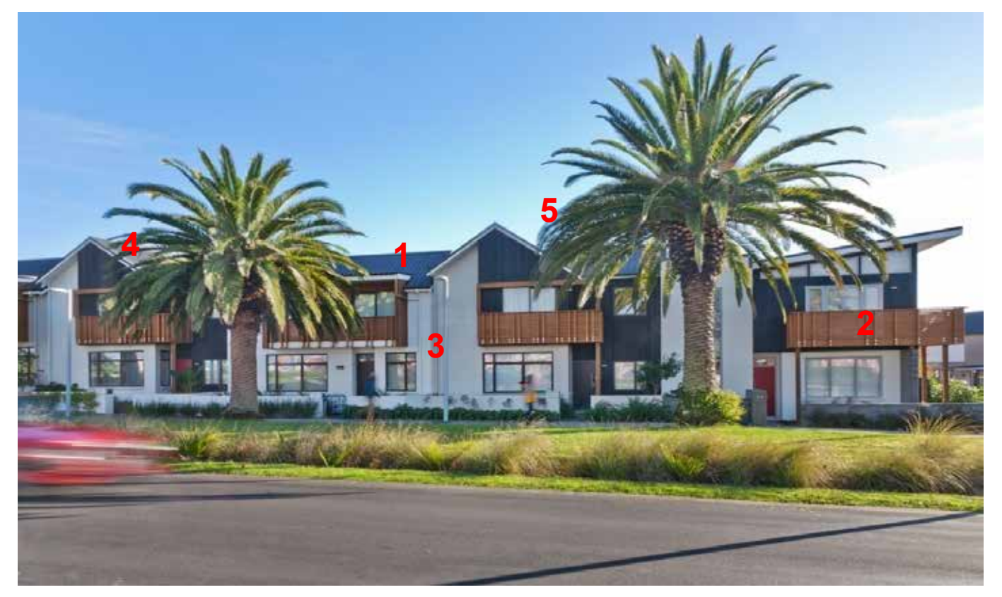
A continuous street frontage of very well designed and highly attractive houses on Buckley Avenue.