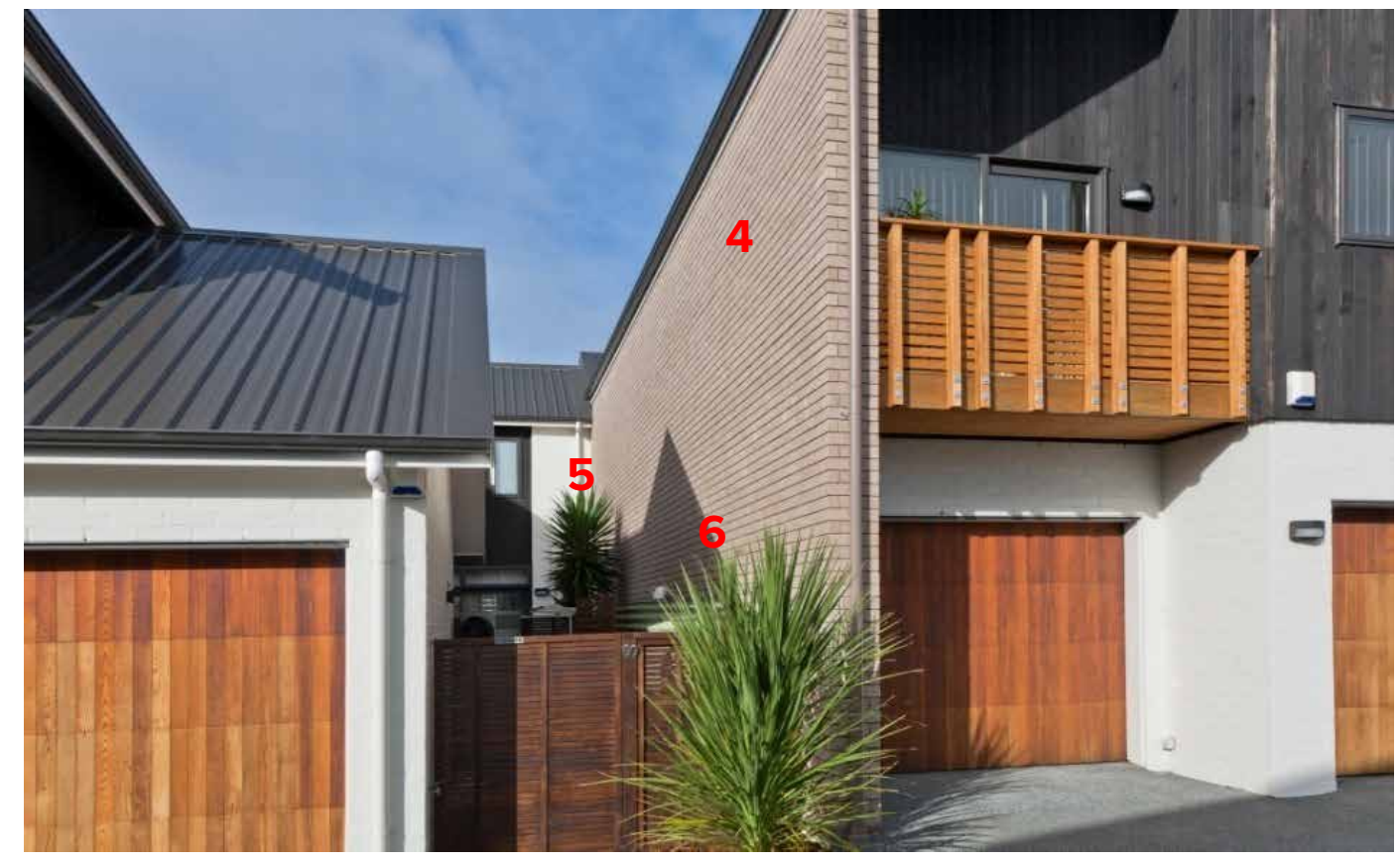
View through to the private outdoor courtyard from the rear lane.