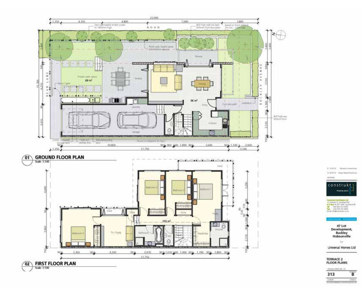
Floor Plans of LOT 10 & 16 - Four bedroom terrace house (corner units).