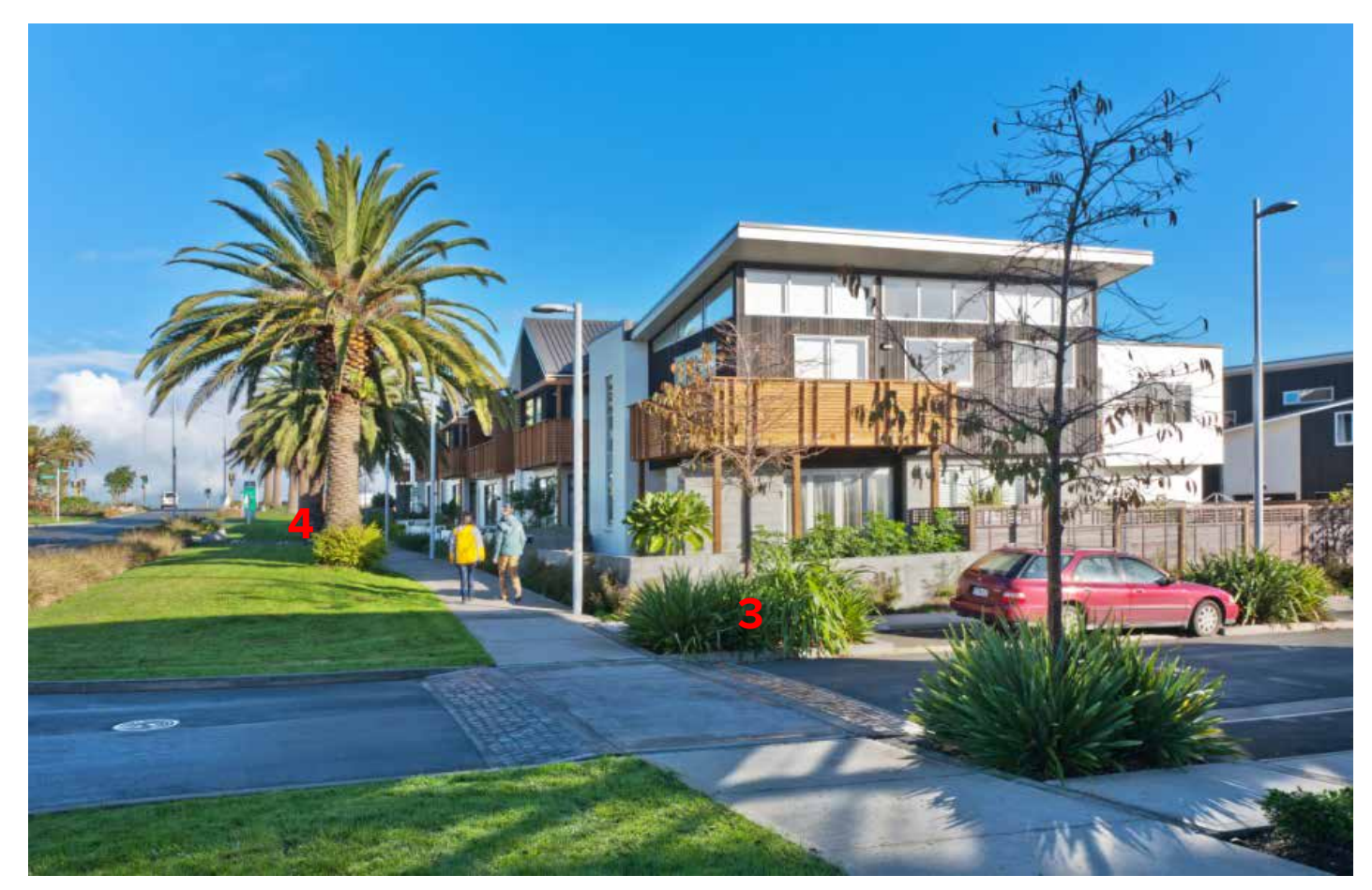
Looking towards the terraces from the corner of Lester Street and Buckley Avenue – Squadron Drive in the background.